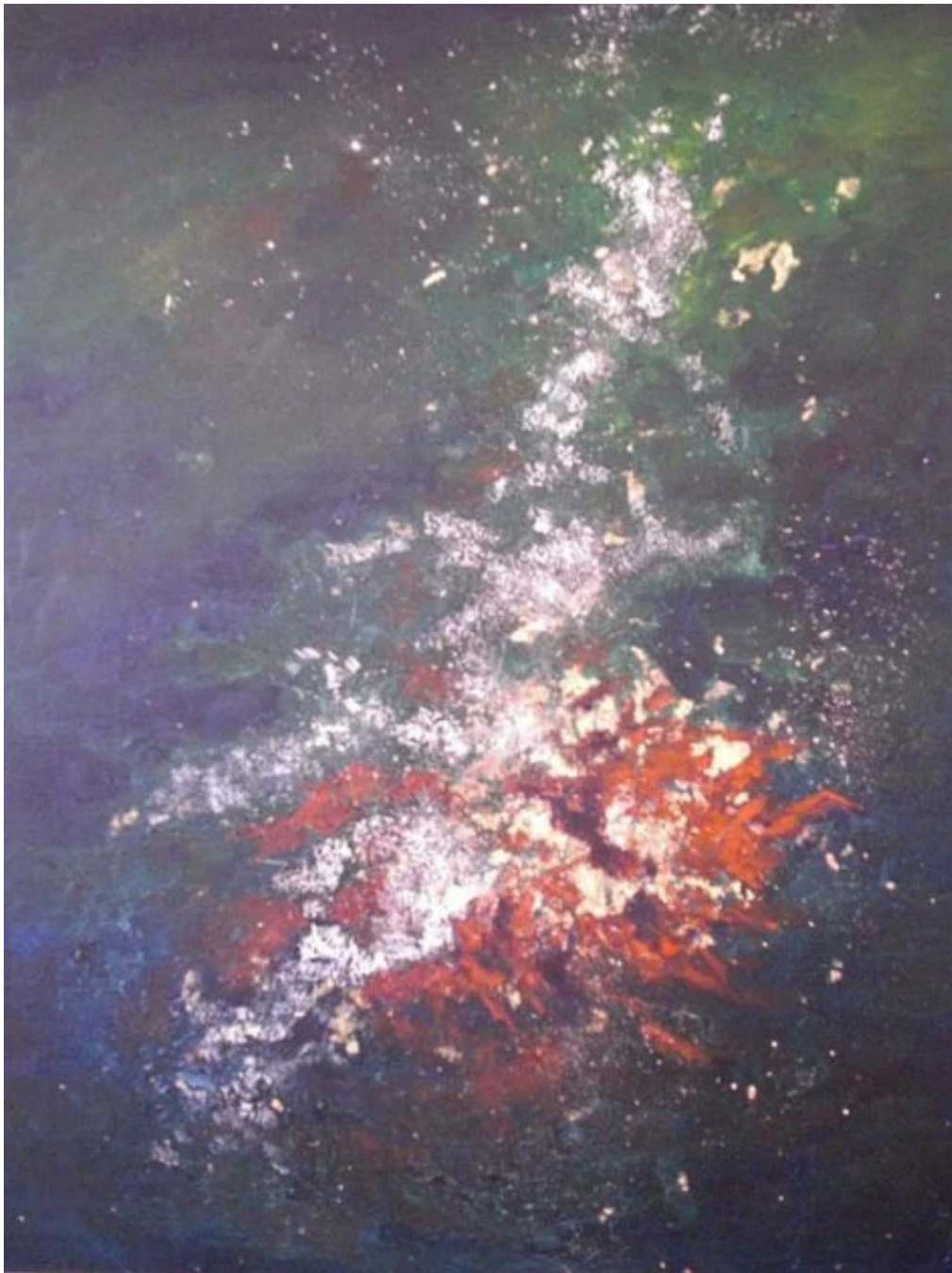
Aparajita Sen, Metamorphosis I, mixed media, 28"x 22".