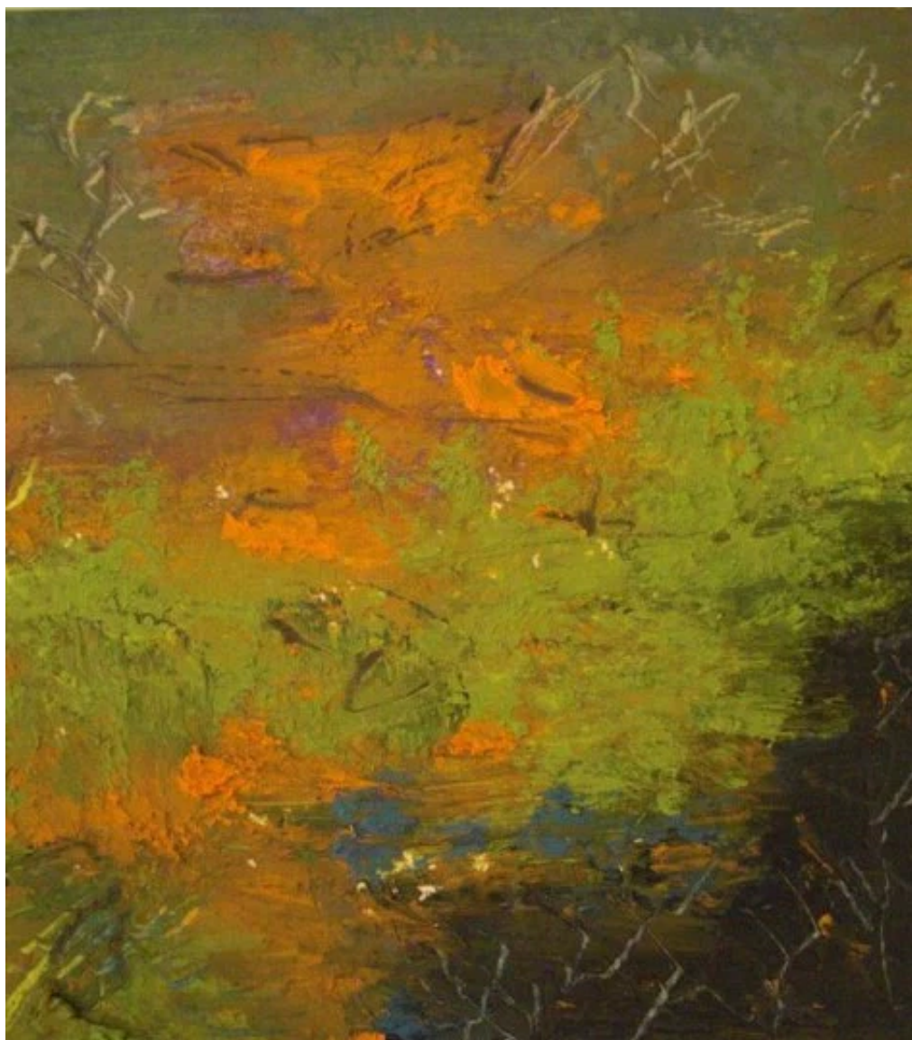
Aparajita Sen, Reflection 3, oil on paper, 4" x 4".